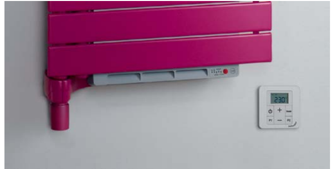
Electric heating fan with timer function and infrared control device

V20180814, RAD_DAS, SL_en, subject to change without notice